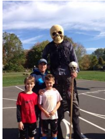
A spooky visitor showed up at Jennings on Saturday...can you guess which staff member is that tall!!!