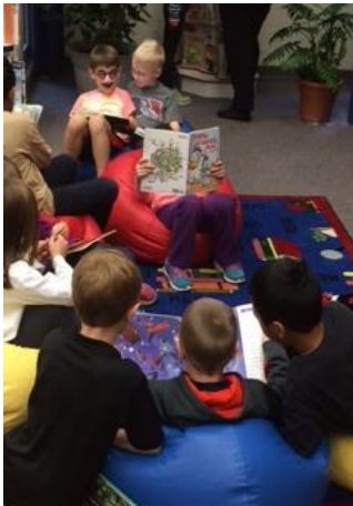
2nd Graders take a few moments to read their newly checked out books in the LLC. They love this cozy area!

For more information CLICK HERE for our weekly Digital Message