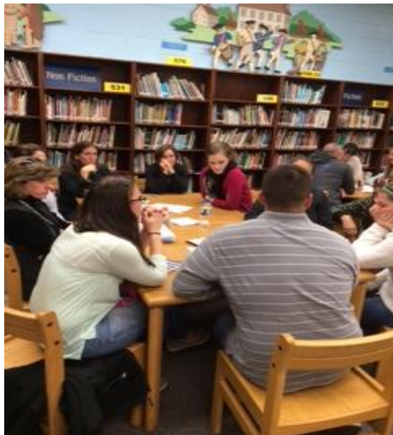
The Jennings staff was working hard on Election Day during a full day of Professional Development workshops.

Please see below for the pictures of the week!