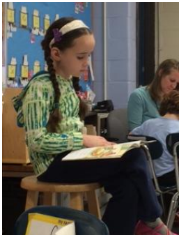
Grade 1 students find comfortable spots to do their independent reading during reading workshop.

Please see below for the pictures of the week!