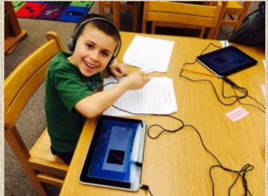
Library Learning Commons