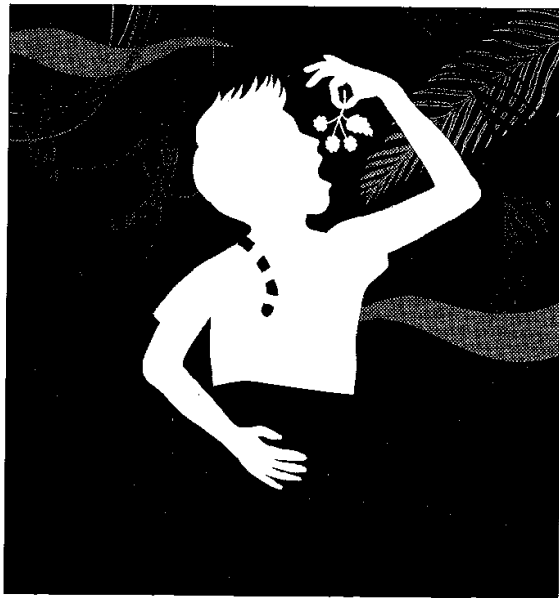
ILLUSTRATION BY DONALD EBY

knowledge to fill in details. "The more senses you involve, the more you experience the text, which means you're also able to recall more about it because concepts move from short-term to long-term memory," Barclay notes.