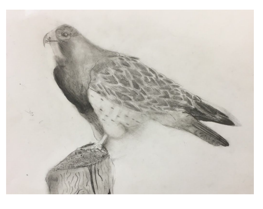
Pencil drawing by Finn Moynahan