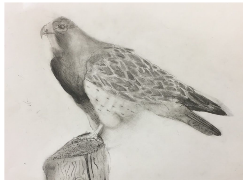
Pencil drawing by Finn Moynahan