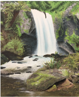
Watercolor painting by Angelina Larracuenta