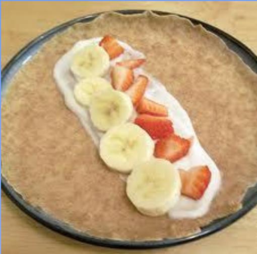
Strawberry Banana Crepes