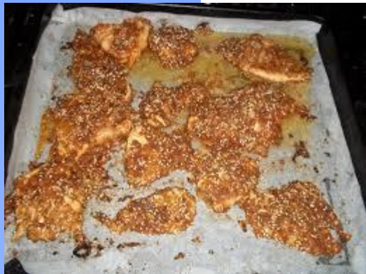
Baked Chicken Cutlets