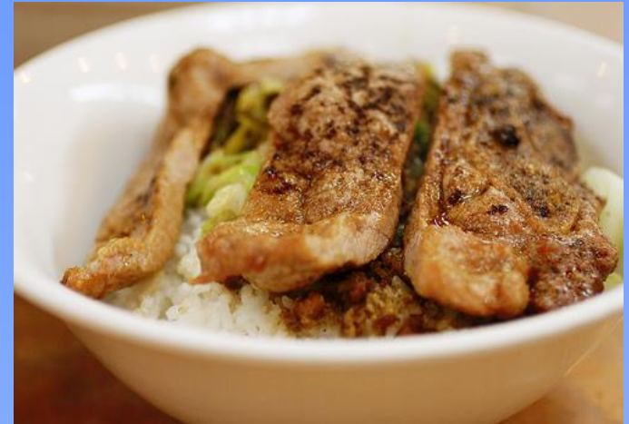
Ants Climbing in a Tree