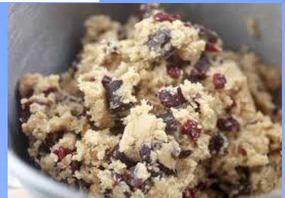
Cranberry Chocolate Chip Cookies